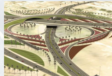
PRODUCT: SS DOWEL BARS PROJECT: DUKHAN EAST CONTRACT VALUE: USD 117,516.00