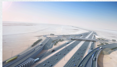
PRODUCT: SS DOWEL BARS PROJECT: UPGRADE ÉRING ROAD VALUE: USD 117,516.00