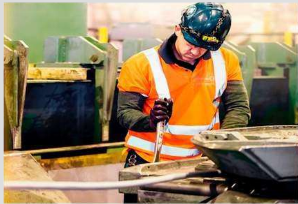
Dowel bars are used in expansion joints for the movement of lateral loads and manage stress within a joint.