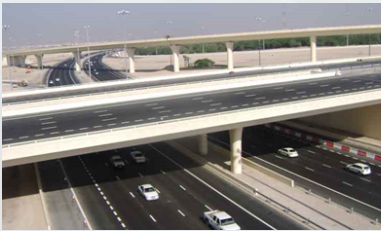
PRODUCT: SS REBARS PROJECT: EAST CORRIDOR VALUE: USD 1,143,699.00