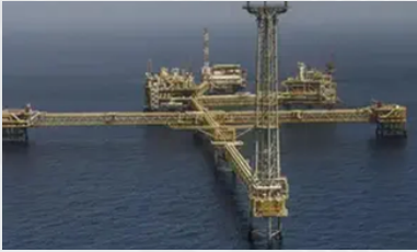
PRODUCT: SS REBARS PROJECT: NORTH FIELD EXPANSION VALUE: USD 3,725,489.00

Since 2012, BIG BLUE has contributed to various infrastructure projects across Qatar serving major clients like Qatar Energy LNG, Ashghal, Kahramaa, Qatar Armed Forces, PEO, Hamad International Airport and many other private customers.