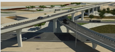
PRODUCT: SS DOWEL BARS PROJECT: NEW ORBITAL HIGHWAY VALUE: USD 128,287.00