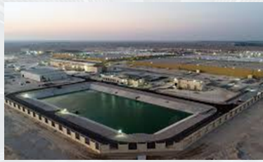
PRODUCT: SHEAR FORCE DOWELS PROJECT: MEGA RESERVOIR VALUE: USD 1,027,528.00