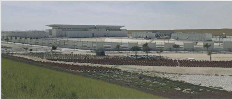
One of the mega reservoirs at a distance. They will be filled with drinking water beginning in 2020.