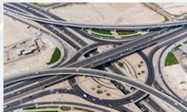
PRODUCT: SS DOWEL BARS & SS REBARS PROJECT: UPGRADE OF RAYYAN ROAD VALUE: USD 705,368.00