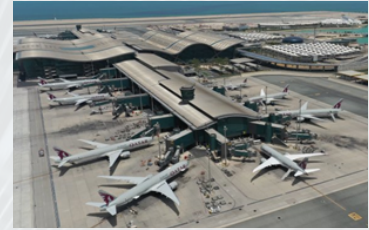
PRODUCT: EPOXY COATED DOWEL BARS PROJECT: HAMAD INT'L AIRPORT VALUE: USD 2,502,178.00