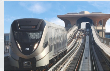
PRODUCT: SS DOWEL BARS PROJECT: DOHA METRO GREEN LINE