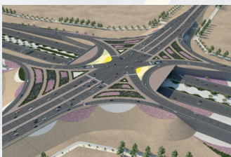
PRODUCT: SS DOWEL BARS PROJECT: AL WAKRAH BYPASS VALUE: USD 90,367.00