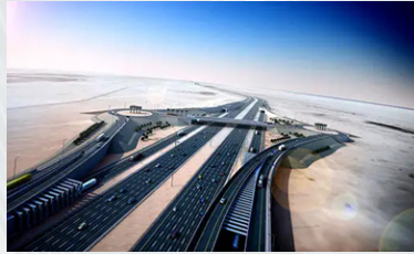
PRODUCT: SS DOWEL BARS PROJECT: AL KHOR EXPRESSWAY VALUE: USD 117,701.00